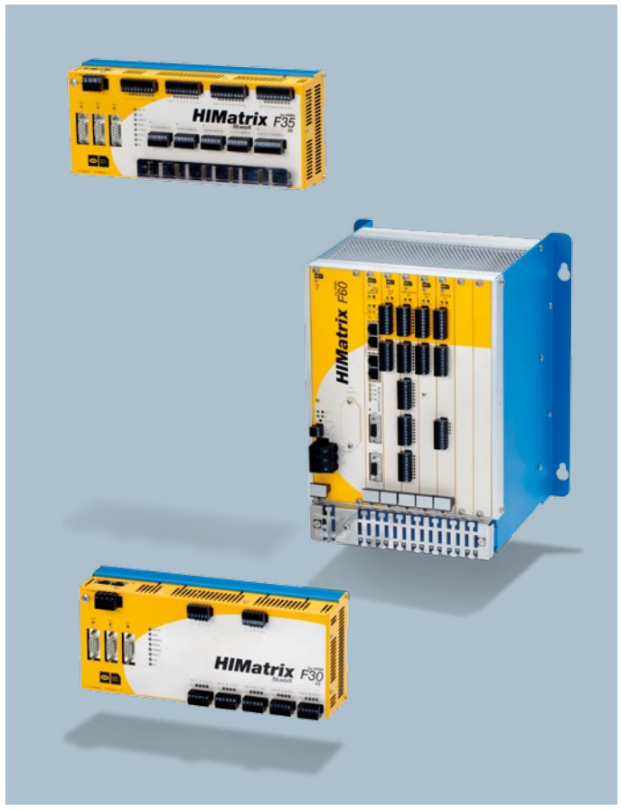
The HIMax and HIMatrix COTS controllers fulfill every safety requirement for the rail industry.