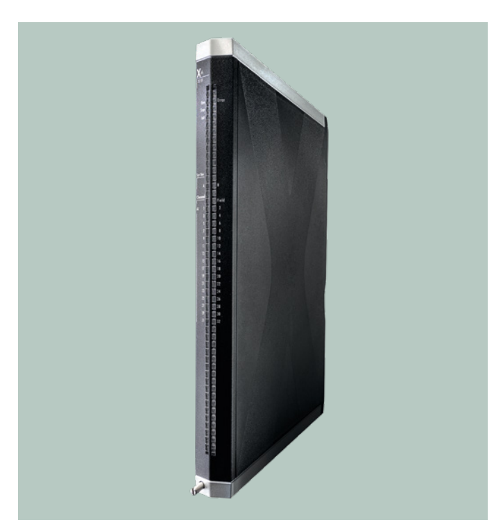
Figure 1: HIMax HART module X-HART 32 01.

The HIMA HART solution sets new standards in the acquisition of diagnostic data from field devices in safety circuits. Plant operators can make the diagnostic data acquired with field devices easily and safely usable for the asset management system. Extended trend information enables meaningful predictive maintenance to the safety systems in the process industry. The analysis of data from the field devices provides decisive information for the operation and maintenance of the plant. Targeted repairs can be planned at an early stage, misuse can be prevented, and defined maintenance intervals can be extended.